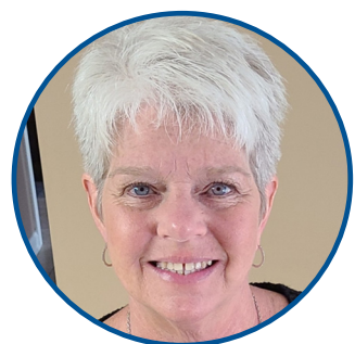
IMMEDIATE PAST PRESIDENT