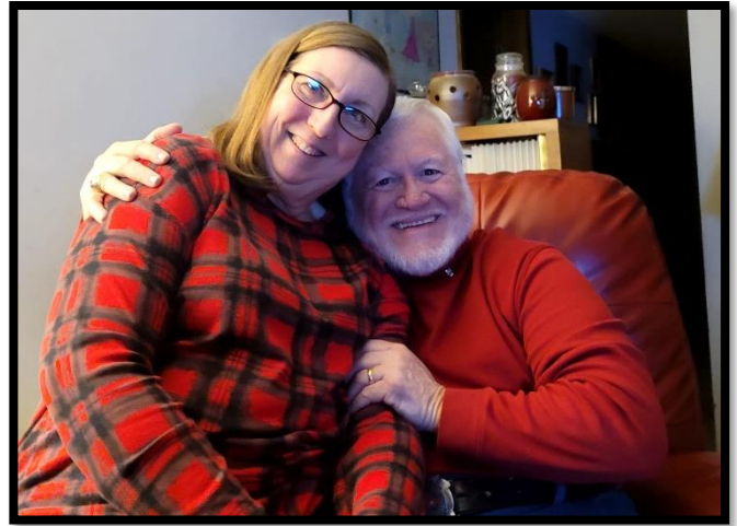
2022 IN OUR RED (Photo credit to Jolie Utley)

Still Waiting... Trying to put through more March 19, 2022 - Cataractathon