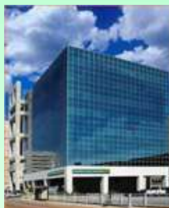
The Hamilton Eye Institute Our new home 2008