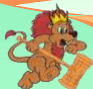
Lion Leaders Weekend