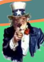
Booster Club 1993

Our Stars of Service Satellite Clinics begin providing care in 1996