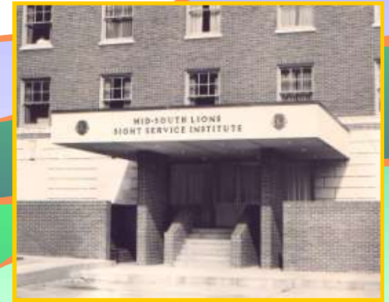
The Brinkley wing at Methodist Hospital becomes our new location in 1959