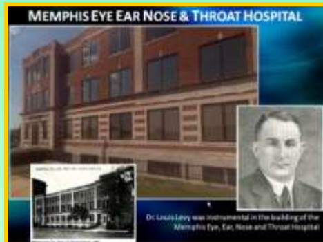
Our First Home And one of our founders