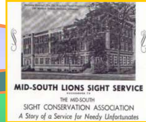
"LIONS" Added to our name in 1953.