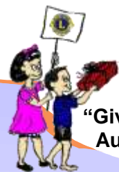
"Give the Gifts" Auction 1992

Our partnership with Methodist Healthcare grows to provide medical equipment, resident training and service to more patients