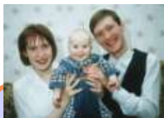
Lithuanian patient sees his son for the first time