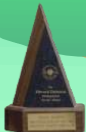
Dalstrom Award established In 1995

1989 Hearing service adopted and our name changed to Mid-South Lions Sight And Hearing Service