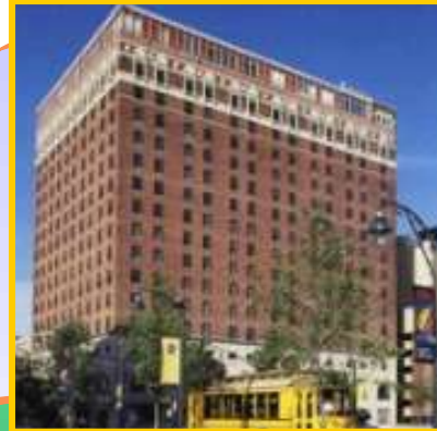
Mid-South Sight Conservation Association's First meeting was at The Claridge House In Memphis